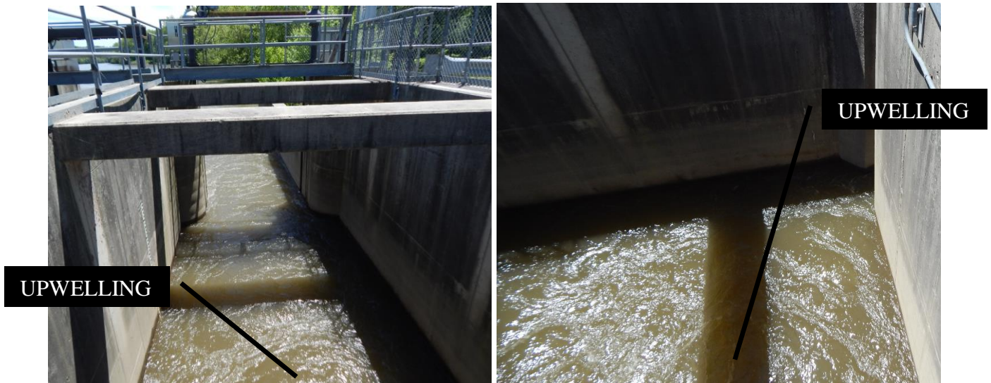
Figure 1 - Visible upwelling within the fish ladder's entrance channel

Generally, a hydraulic upwelling should never be visible within the entire longitudinal profile of a well-maintained zone of passage for migratory fish. The Licensee should consider reducing the amount of flow going through the floor diffuser system to ensure visible upwelling is not occurring in the fishway.