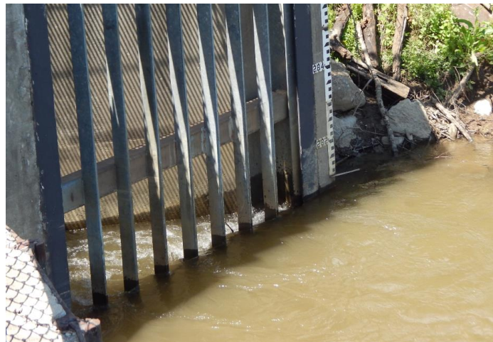
Figure 3 - Head differential at the exit channel trash rack caused by debris accumulation

Thank you for the opportunity to participate in this review. For questions please contact Jesus Morales at 413-253-8206.