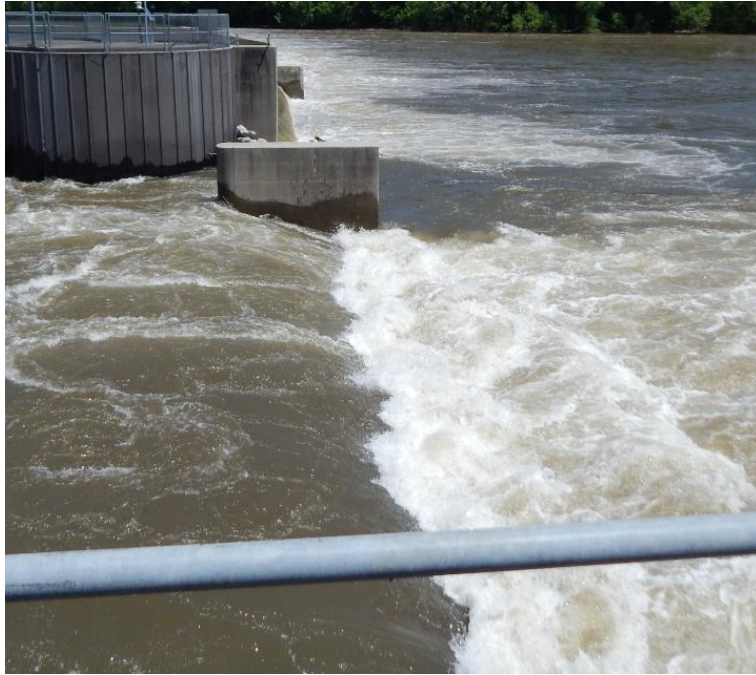
Figure 2 – Energy dissipation pool downstream control weir is submerged by tailrace pool