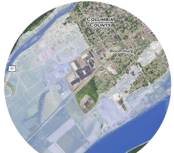
The map above shows the extent and depth of a flood resulting from stage 32.8' (record flood stage) at Bloomsburg, PA.

River Flooding: The National Weather Service (NWS) issues river forecasts based on expected rainfall and river conditions in the watershed. Based on the forecast from NWS, you can view a map that most closely resembles the predicted extent of the flood.